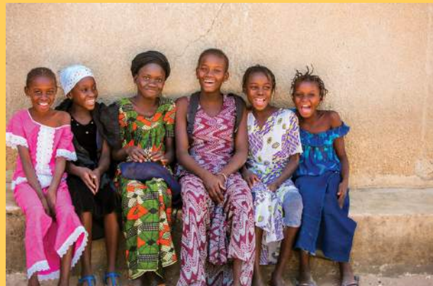
WGEP Senegal scholars gather to socialize after school.