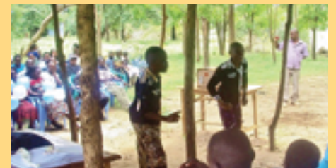
For the first time ever, boys participated in the Alternative Rite of Passage Program in 2013 to show their support for their sisters, cousins and friends.