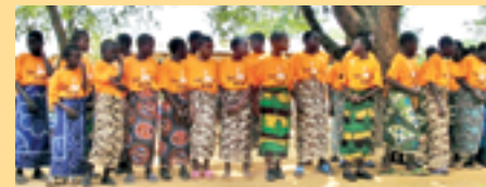
Alternative Rite of Passage event

"Circumcision With Words" program adopted by WGEF to counter female genital mutilation as a barrier to girls' education