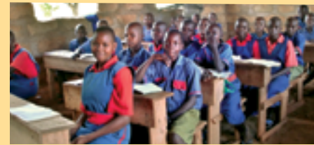
WGEF's first Kenyan scholars