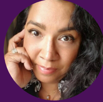
Zahira Class Secretary