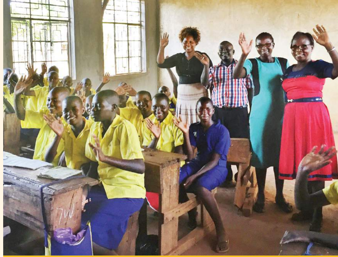
Kenyan students learn about health and gain life skills at WGEP clubs.