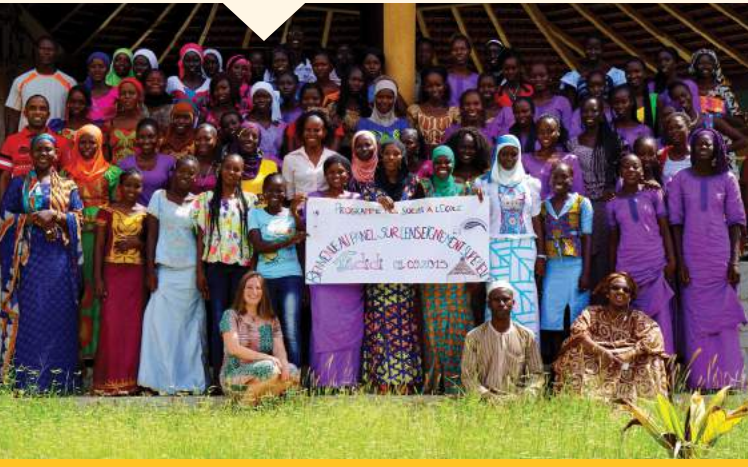
WGEP graduates attend our panel discussion on higher education.