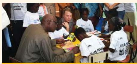
Senegal Ministry of Education and USAID inaugurate WGEP's new literacy center.