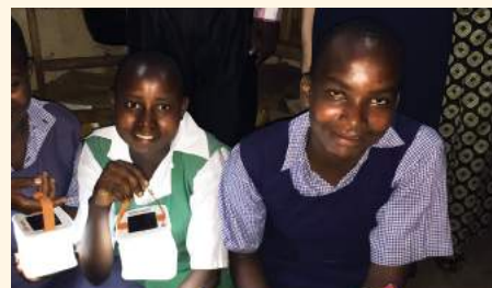
Scholars enjoy new books and lanterns.