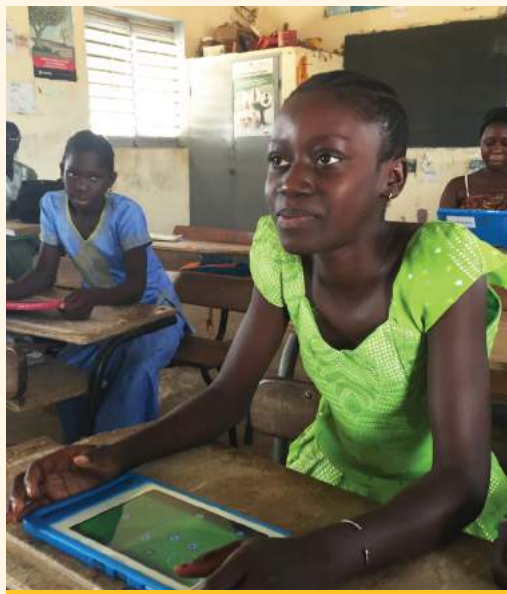
Students gain literacy skills using tablets.