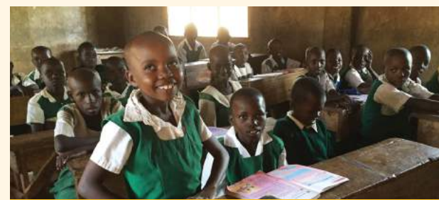
Students participate in reading activities.