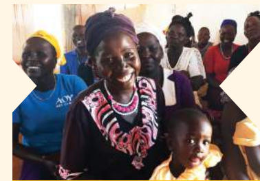
Mothers learn to read and write in our Adult Literacy classes.